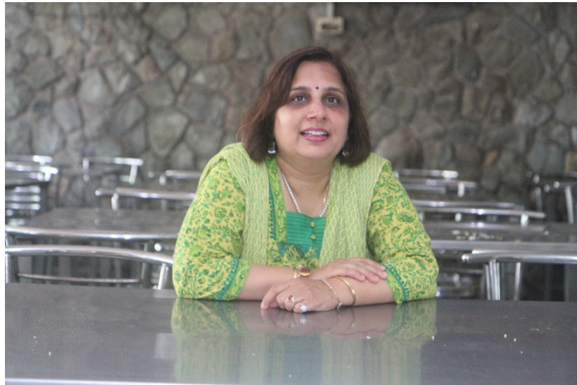
The dining experience at DH.